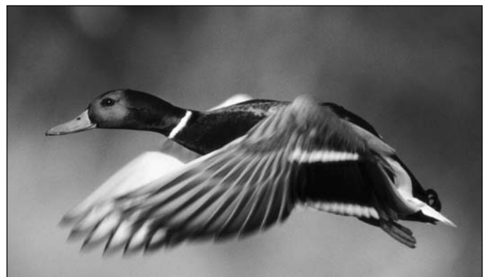
Mallard ducks are shot for sport by wildfowlers.

As many as a million wildfowl, including ducks, are shot every year for sport. The wildfowlers hide under cover