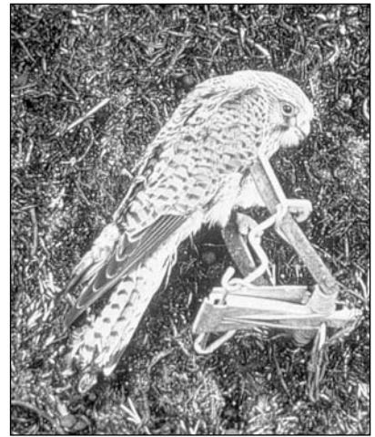
A protected Kestrel caught in an illegally set Fenn trap.

To preserve their valuable 'game birds', gamekeepers set traps and snares to kill stoats, weasels, foxes, polecats and other natural predators. Sometimes protected species, such as badgers, otters, wild cats, kestrels and owls, fall victim to these snares and traps. These indiscriminate devices also catch hares, rabbits, squirrels, hedgehogs, deer and sometimes domestic cats and dogs.