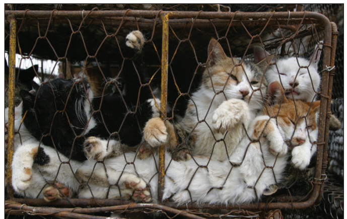
Millions of dogs and cats in China are killed so that their fur can be turned into trim and trinkets.

Animals on fur farms are killed using the most gruesome methods. They are electrocuted (through the use of electrodes in the mouth and anus), gassed and have their necks violently broken. If they are lucky, they will be given a lethal injection. If they are unlucky, they will be skinned alive - as often happens in China.