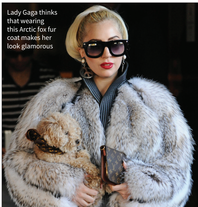
Lady Gaga thinks that wearing this Arctic fox fur coat makes her look glamorous

It's not just coats - fur is used as trim on gloves, hats, cuffs and collars and to make pom poms and toys.