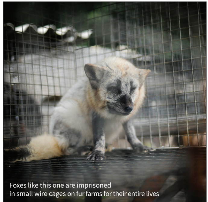
Foxes like this one are imprisoned in small wire cages on fur farms for their entire lives

Fur farming is banned in Austria, Croatia and the UK.