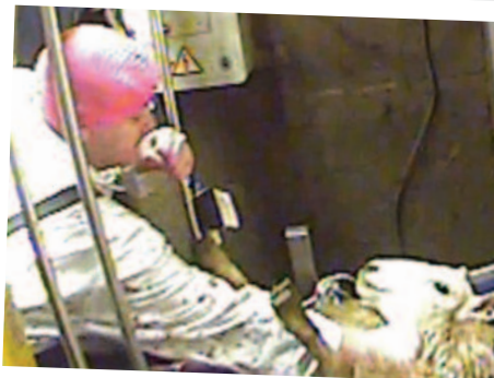
Abuse of animals is commonplace.

That is why we urge people to adopt an animal-free diet.