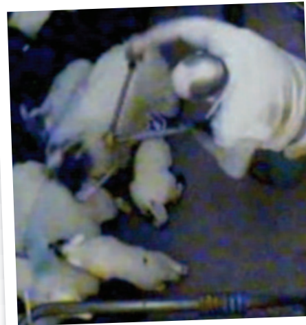
A ewe is stunned while her lamb suckles.