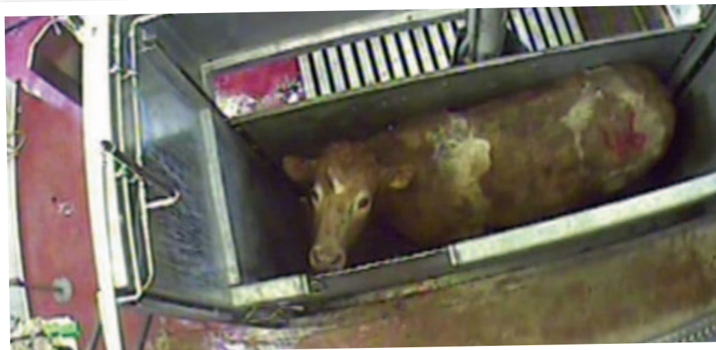
A cow waits to be shot in the head with a 'captive bolt'.