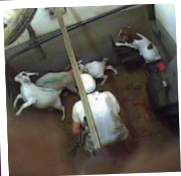
Goats are desperate to escape the electric tongs.

In January 2009, Animal Aid embarked on an unprecedented undercover investigation of English abattoirs.