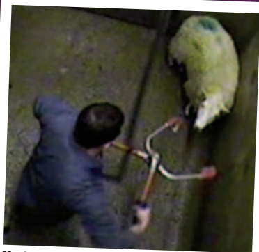
Moving in with the electric tongs...

We have filmed in ten randomly chosen slaughterhouses in nine counties. They killed pigs, sheep, cows and goats.