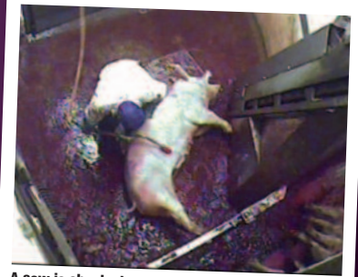
A sow is shocked across the body.

None of these abuses would have come to light without Animal Aid's intervention.