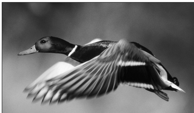
Mallard ducks are shot for sport by wildfowlers.

As many as a million wildfowl, including ducks, are shot every year for sport. The wildfowlers hide under cover