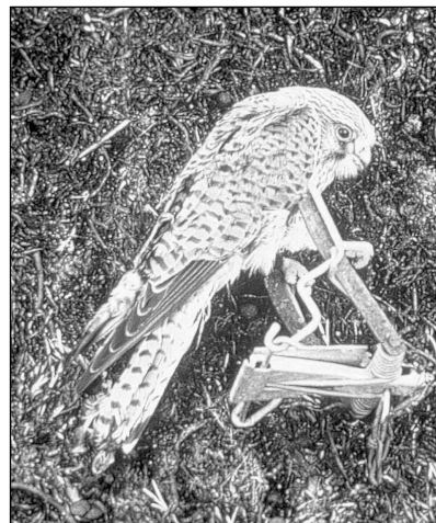
A protected Kestrel caught in an illegally set Fenn trap.

Snares are particularly cruel because the animals caught in them are not killed outright. If snared around the neck, they may be slowly choked to death as the wire tightens.