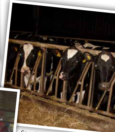
Cows in a zero-grazing unit