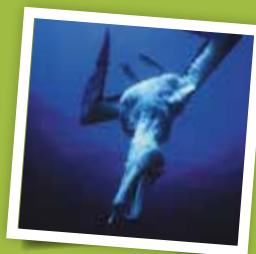
A dead albatross caught on a fishing line

Over-fishing is driving many fish species to the brink of extinction. Many non-target fish get caught in trawlers' nets (known as bycatch) and are simply thrown back into the sea, dead. An estimated 300,000 whales, dolphins and porpoises also die in fishing nets every year. 11