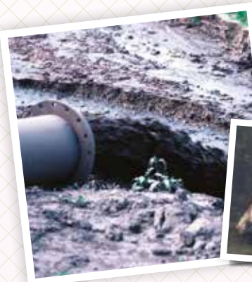
Fish suffocated by water pollution.

These nutrients cause algae to grow in abundance, creating an algal bloom. When these plants die, bacterial decomposition uses up the oxygen in the water. This process, called eutrophication, leads to fish and other aquatic creatures dying through suffocation.