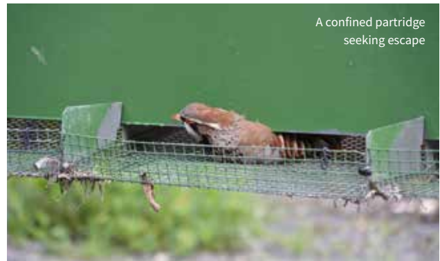
A confined partridge seeking escape

Partridge-breeding cages are smaller, confining breeding pairs in enclosed metal boxes that are just as claustrophobic and restrictive as the pheasant units. In the wild, partridges roam vast areas and