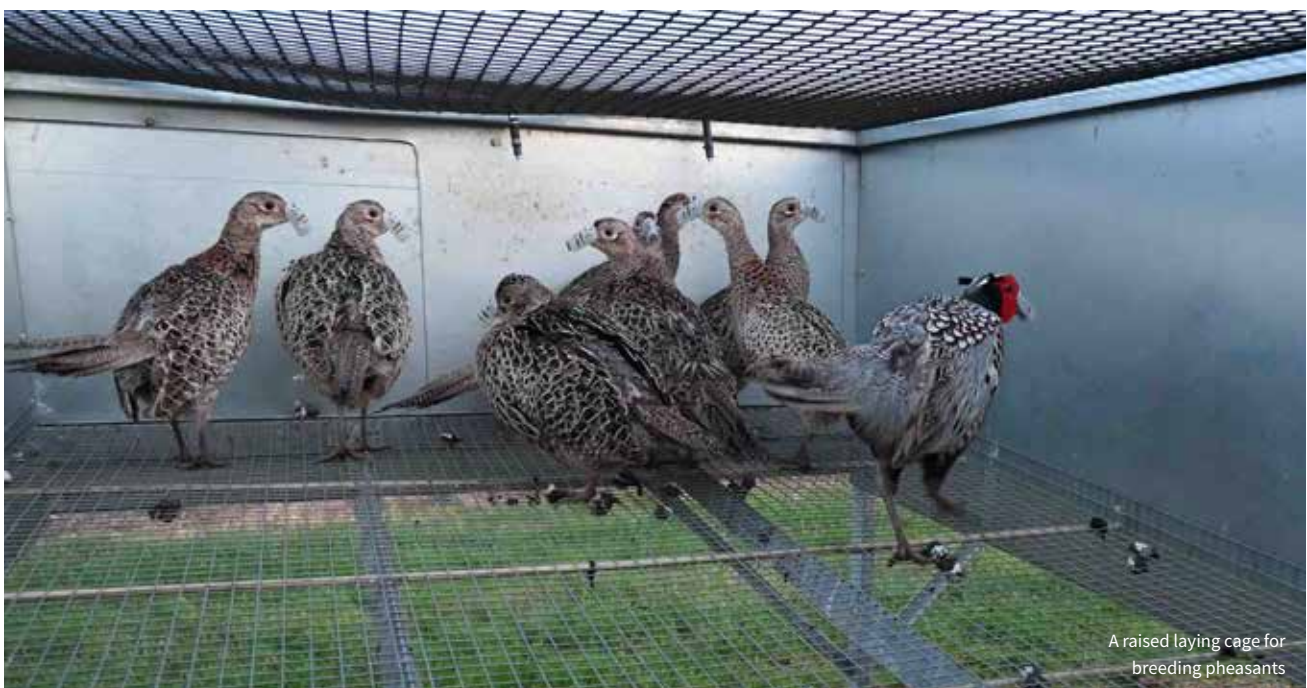
A raised laying cage for breeding pheasants

In an effort to eliminate the effects of aggression between birds caused by the crowded conditions and unnatural groupings in breeding cages, restraining devices ('bits') are fitted over the birds' beaks to prevent them pecking their cagemates. Although this may limit some of the wounds birds inflict on one another, it does nothing to reduce their stress from being caged in a harsh, crowded environment. Bits are also used on the birds to limit wounding during rearing.