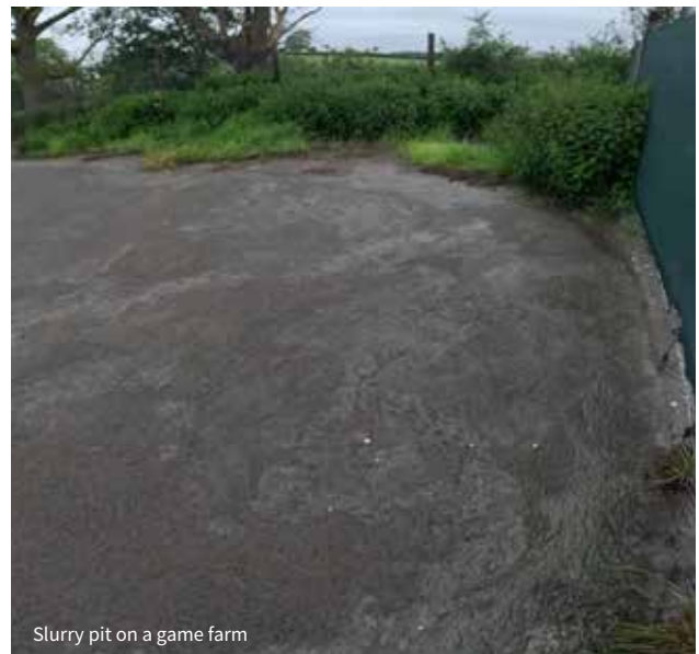
Slurry pit on a game farm

These are just two examples but are unlikely to be exceptional. Unfortunately, pollution information is hard to obtain and specific pollution incidents often go undetected. Water pollution and other forms of local environmental pollution are increasing concerns across the UK. It is clear that intensively rearing 40-60 million gamebirds each year is playing a part in that pollution.