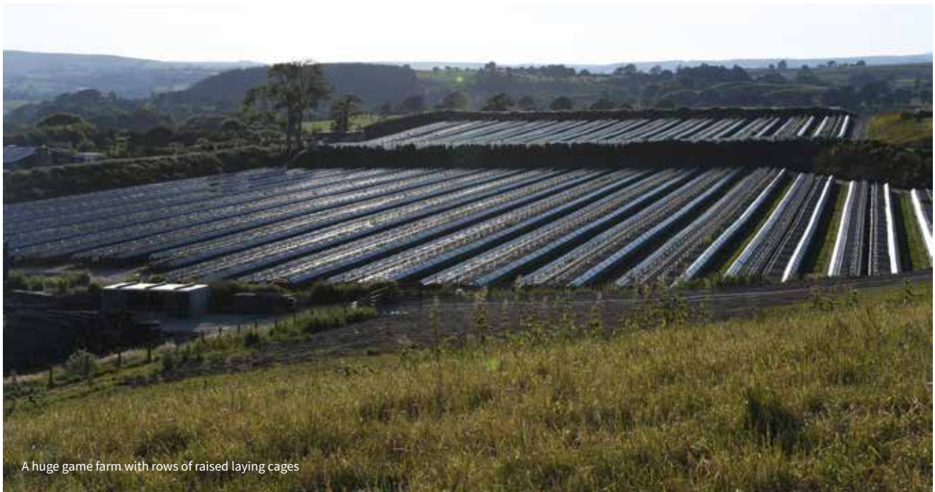
A huge game farm with rows of raised laying cages