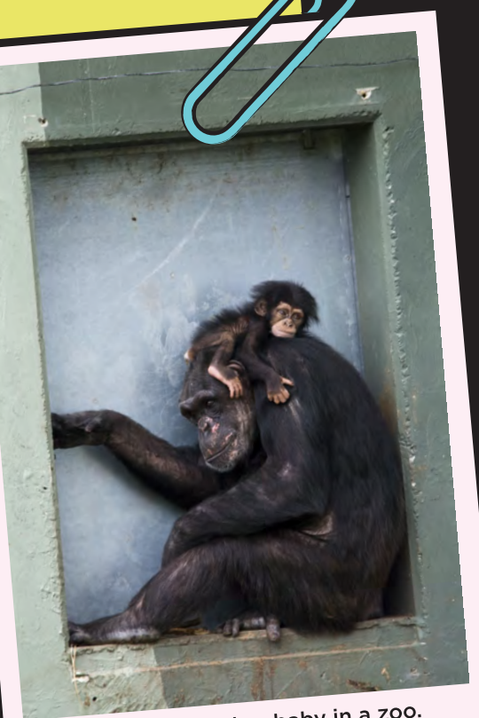
A chimpanzee and her baby in a zoo.

CAN THEY REASON? CAN THEY TALK? CAN THEY SUFFER?