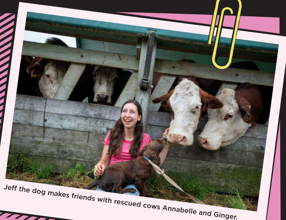
Jeff the dog makes friends with rescued cows Annabelle and Ginger.

What do you think - how should we treat animals?