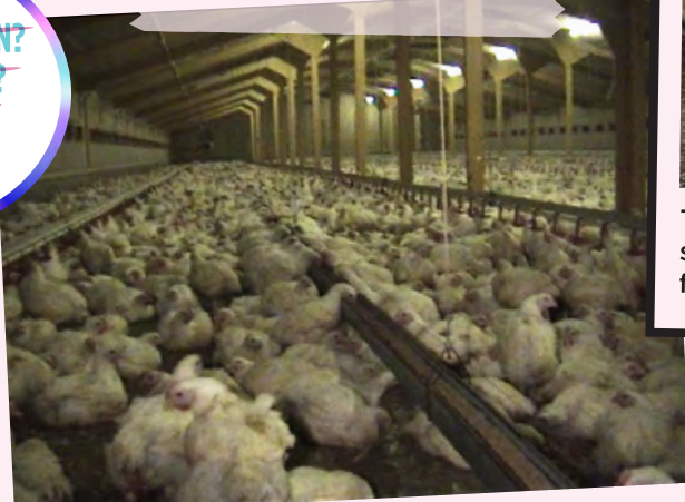
Most chickens are crammed into factory farms like this one. They are slaughtered at just 6 weeks old.

CAN THEY REASON? CAN THEY TALK? CAN THEY SUFFER?