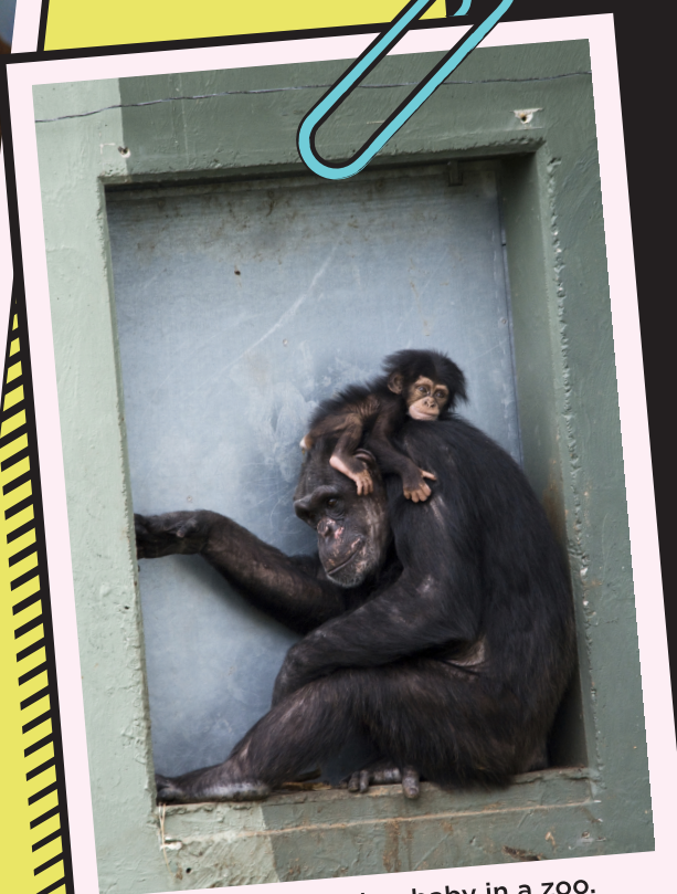
A chimpanzee and her baby in a zoo.

CAN THEY REASON? CAN THEY TALK? CAN THEY SUFFER?