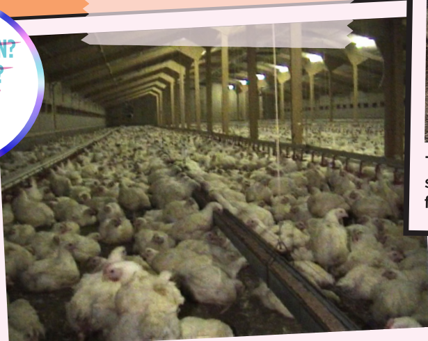
Most chickens are crammed into factory farms like this one. They are slaughtered at just 6 weeks old.

CAN THEY REASON? CAN THEY TALK? CAN THEY SUFFER?