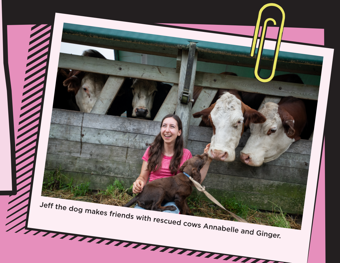
Jeff the dog makes friends with rescued cows Annabelle and Ginger.

Religions such as Hinduism , Buddhism , Sikhism and Jainism teach the concept of ahimsa - nonviolence to all living beings. Many followers of these religions avoid eating animals.